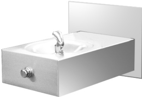
Model 90-WC Drinking Fountain illustration