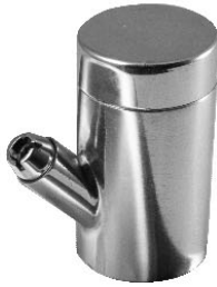
F-503 Bubbler - Standard (STD) Mirrored Stainless Finish