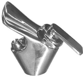
F-501-L Bubbler - Standard (STD) Mirrored Stainless Finish