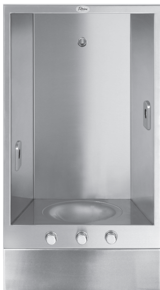
Model 103MOD-ALC-HL Illustration only.