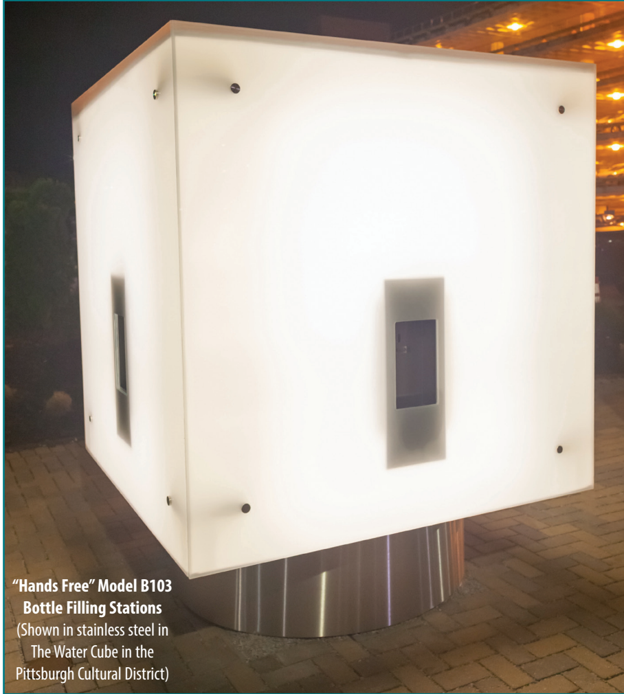
"Hands Free" Model B103 Bottle Filling Stations (Shown in stainless steel in The Water Cube in the Pittsburgh Cultural District)

Filtrine offers a wide variety of "Hands Free" drinking water equipment in stainless steel or bronze in different finishes, and a wide selection of powder coat colors