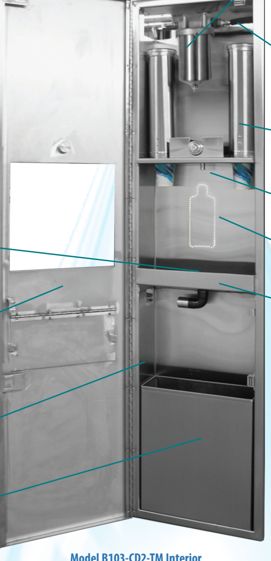
Model B103-CD2-TM Interior (Shown in stainless steel with satin finish and standard options)

Taste Master water purifier with easy to replace recyclable carbon filter* contained in stainless steel housing