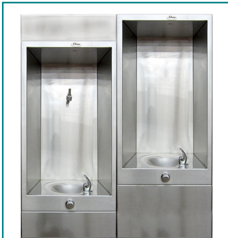
103-ALC-HL Shown with optional bottle filler. Illustration only.