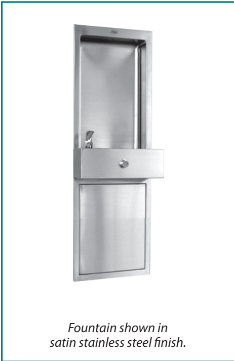
Fountain shown in satin stainless steel finish.