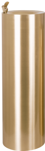
Model 125-CP Shown in Satin Finish Bronze and Mirror Finish Bubbler