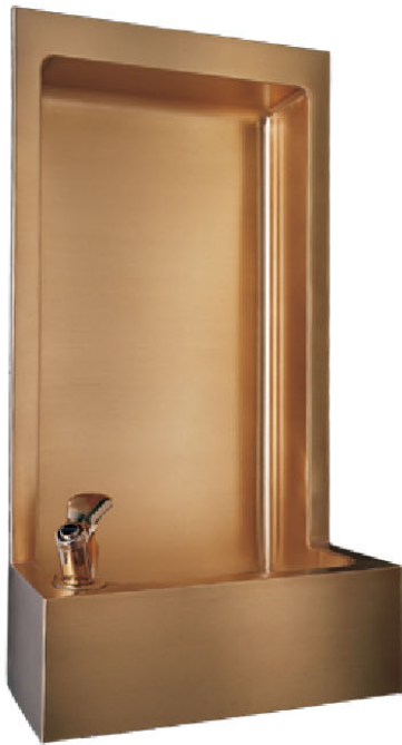
Fountain shown in satin bronze finish