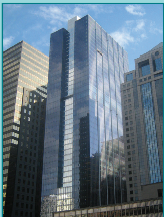
155 Wacker in Chicago, IL

This high-end, 48-story, office building in downtown Chicago was renovated by a local developer who was keenly aware of the expense and logistical pitfalls of bottled water in large office spaces. They were looking to provide a space that had the future occupants' best interest in mind and included unique features to attract more buyers/tenants. Another goal was to bring the building in compliance with ADA guidelines and achieve LEED-CS Gold Status.