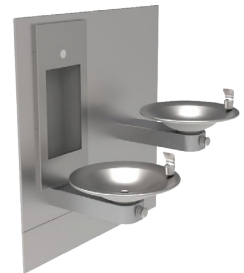
Model B103-107-14-MOD-HL* (with matching 107-14 fountains)

* Non-recessed fountain bubbler activated by remote ADA Compliant "Soft Touch" valve (vandal proof options available)