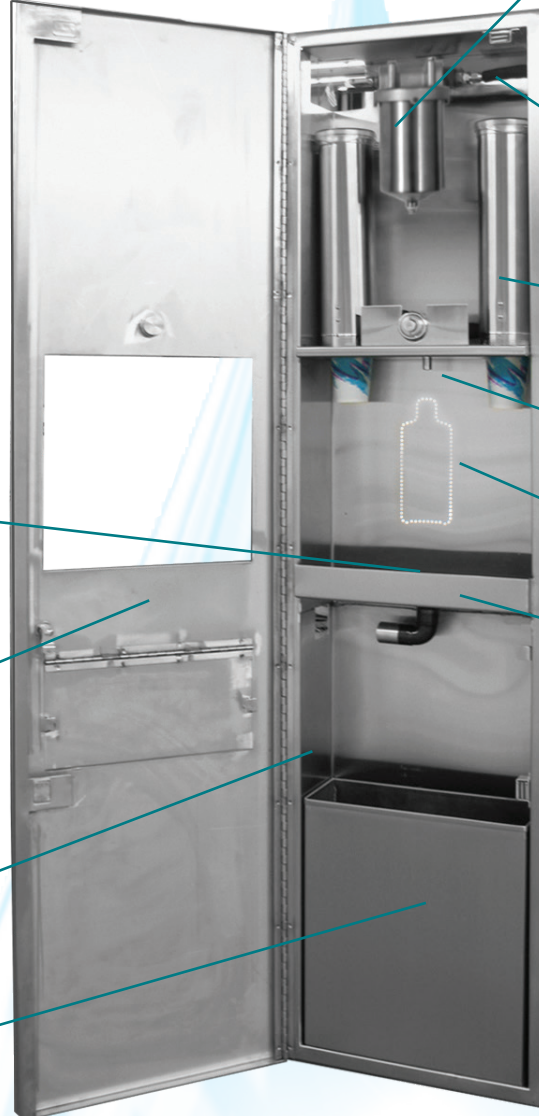
Model B103-CD2-TM Interior (Shown in stainless steel with satin finish and standard options)

Taste Master water purifier with easy to replace recyclable carbon filter* contained in stainless steel housing