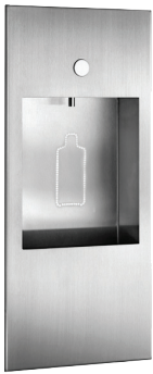
Model B103 (with optional bottle LED lights, standard "Soft Touch" flush mount push button)