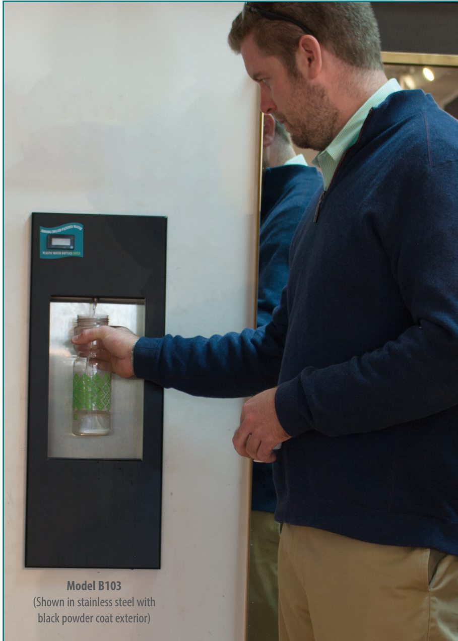
Model B103 (Shown in stainless steel with black powder coat exterior)

Filtrine offers a wide variety of energy saving bottle filling station models in stainless steel or bronze in different finishes, and a wide selection of powder coat colors