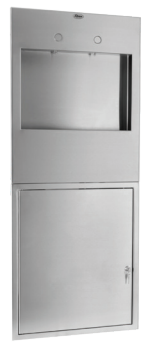
Model FCC-B103 (louvered door) and FC-B103 (optional dual fillers that could dispense hot and cold water) (purifier/chiller in cabinet below)