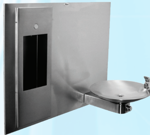
Model B103-107-16* (with matching 107-16 fountain)