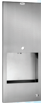
Model B103-TM (purifier in cabinet above)