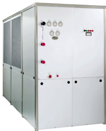
TYPICAL CHILLER SHOWN