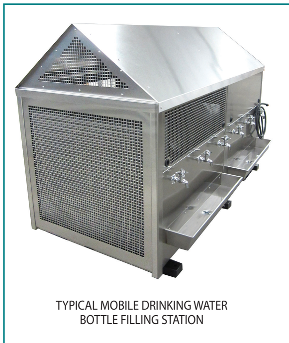
TYPICAL MOBILE DRINKING WATER BOTTLE FILLING STATION