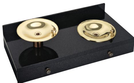
Model 121-HL Deck Fountain Shown with mirror finish bronze bowls and "Soft-Touch" push-buttons.