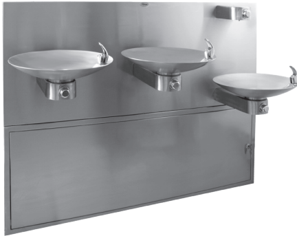
107-16-HHL-VP-TM Illustration only.

VANDAL PROOF High/High/Low Drinking Fountain with Bottle Filler/Taste Master® Purifier