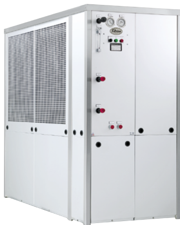
TYPICAL CHILLER SHOWN