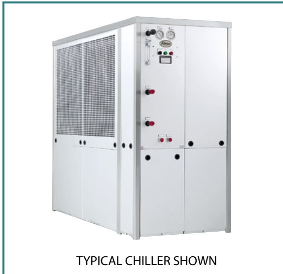
TYPICAL CHILLER SHOWN