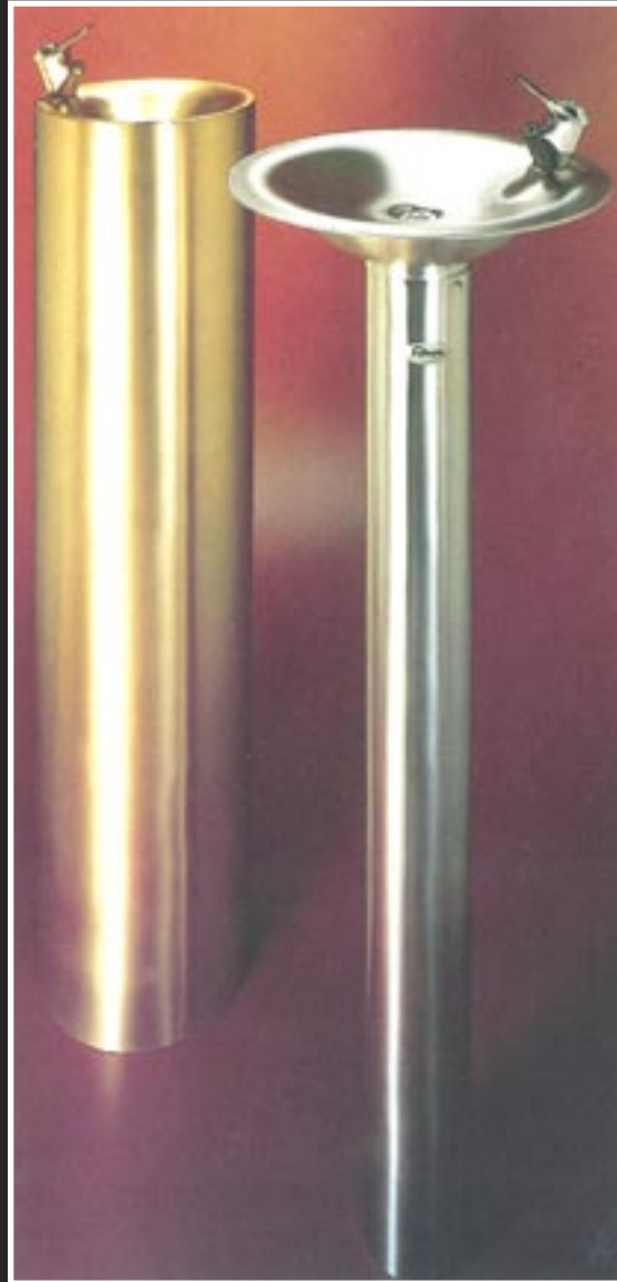
Model 125-CP Pedestal Fountain (background) shown in #4 satin finish bronze with mirror finish bronze push button bubbler and drain.